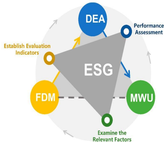
Figure 1. Framework for ESG Evaluation Components (Mankevich, 2024; Namunyola & Mwangi, 2025; Nurgaliyeva et al., 2024).